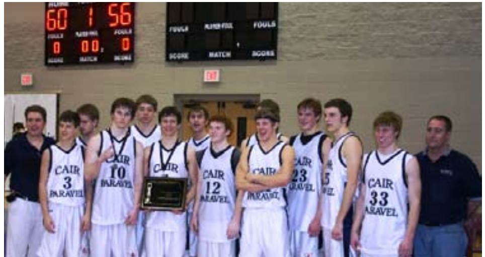
A happy group of Lions show off their KCAA Championship trophy moments after downing Olathe Christian, 60-56.