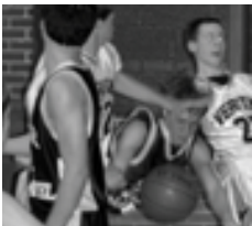
On the Road Again...