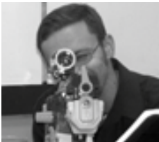
New Snooze Alarm