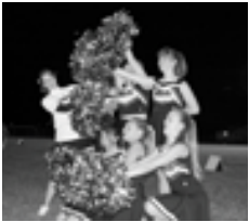
CPLS Cheerleading and Pep Band?