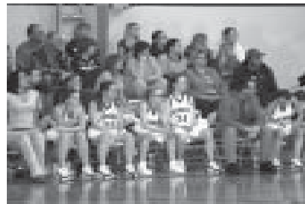
McLouth fans pack the stands behind the CPLS bench.

We urge CPLS students who are basketball fans to consider moving the student section to the east side of the gym. All it would take is for a few upper-class leaders to ensconce themselves