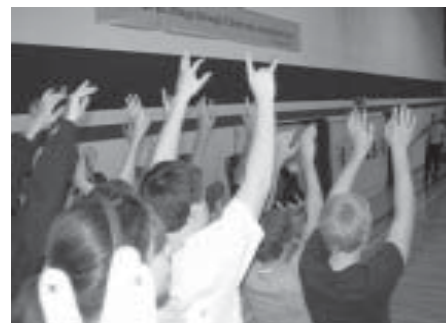
Lions fans cheer their team on to victory over McLouth, albeit from the west side of the gym.

in the bleachers behind our teams, and all the younger students would follow. Is there anyone brave enough to do this?