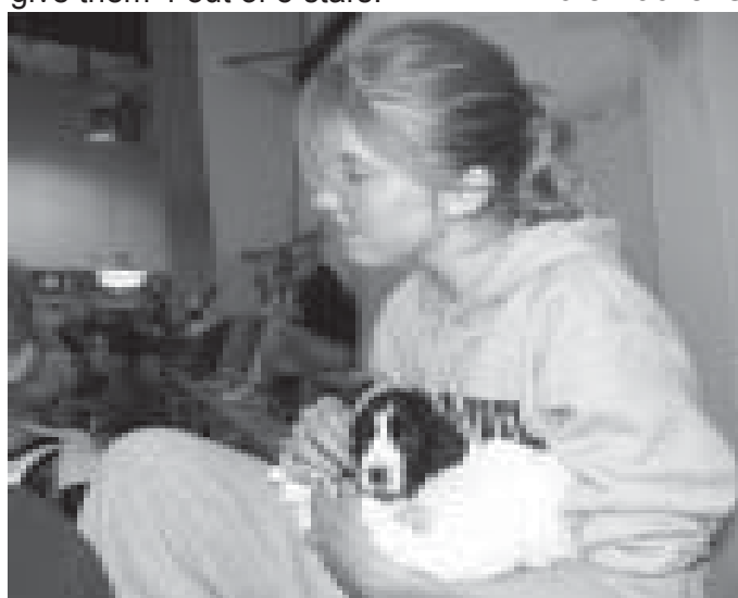
Picture of the Month-- Happiness is a Warm Puppy

So, "I'm thinking Arbys," and I give them 4 out of 5 stars.