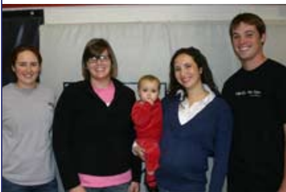
CLASS OF 2001