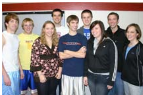
CLASS OF 2006