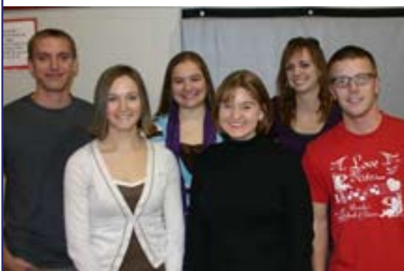
CLASS OF 2003