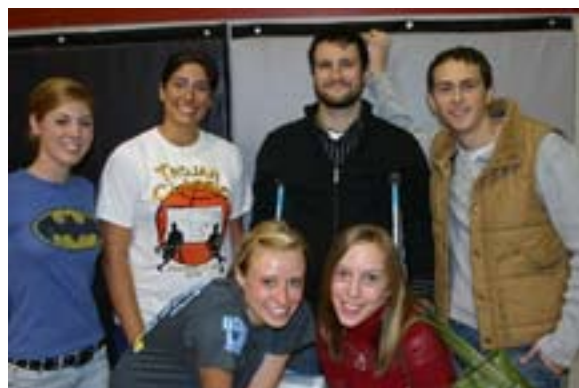
CLASS OF 2004