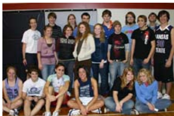
CLASS OF 2007