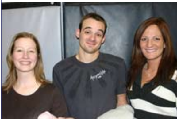
CLASS OF 1999

Recognize anyone you know? CPLS Alumni and friends gathered on Friday, December 21st to reconnect and visit with friends. Over 70 alumni attended the event coming from as far away as California, New York and Australia. The annual alumni vs varsity volleyball and basketball games were greatly entertaining, but the results are being withheld to protect the embarrassed.