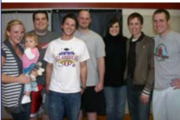
CLASS OF 2002