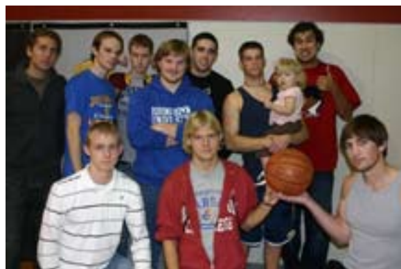
CLASS OF 2005