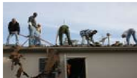
The old shingles and tarpaper is chucked over the roof into a waste container.