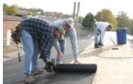
After tearing off the old roofing, the men apply new plywood and tarpaper.