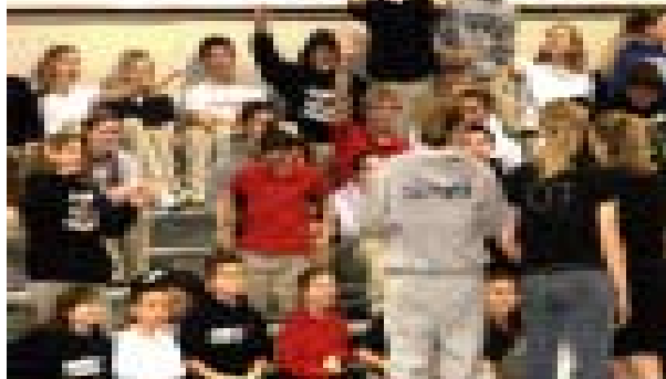
The last pep rally at CPLS was held in the 2004-2005 school year, when this year's seniors were freshmen.