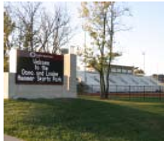
CPLS football fans will witness history Saturday night as their undefeated football team plays in the KCAA Championship game in the Hummer Park football stadium.