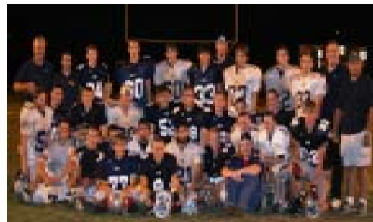
The alumni in white uniforms, and the varsity in blue, all posed after their Sept. 28th game at Chandler Field. The varsity beat the alums 40-8.