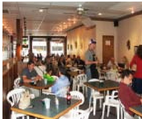
The Food Dude found the Classic Bean, 722 Kansas Avenue, as a viable alternative to the Friday Fast Food Fix.

After each group finished their part, they saluted, and closed off their performance with jazz hands. As a bonus, the oldest group of girls got to cheer with the cheerleaders for the rest of the game.