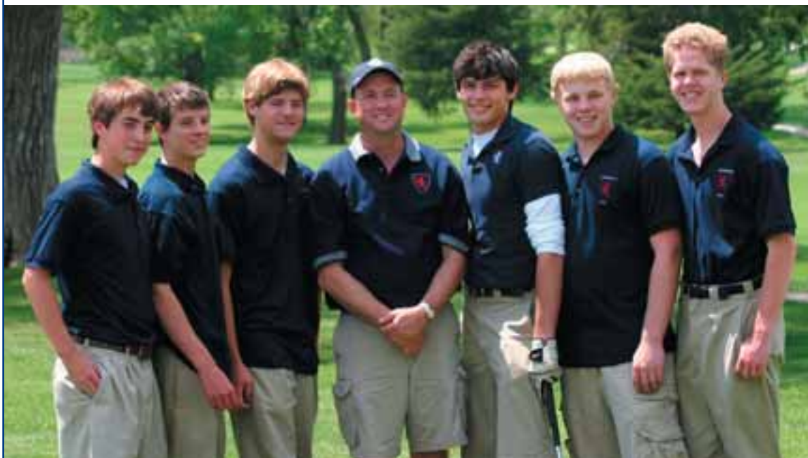
The CPLS Boys Golf Team took 3rd place in the 4-man Team Total competition at the KCAA State Golf Tournament on Thursday, May 10th.