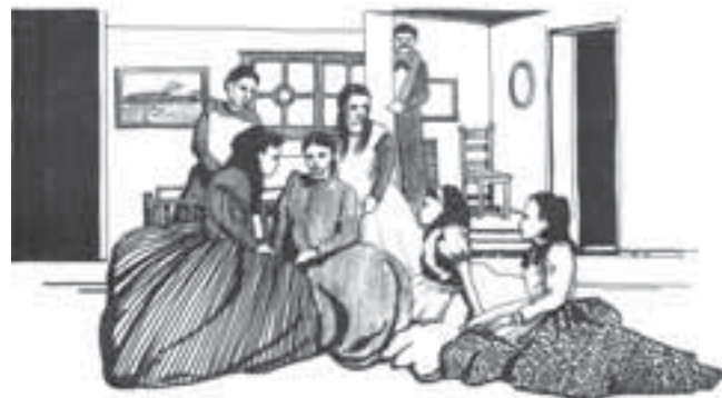
Photo CD’s are now available for the casts of “Little Women.” The CD’s will be available in the school office for $3.00 each. There are separate CD’s for each cast. Make checks payable to Colleen Lippe. Call Colleen with questions.