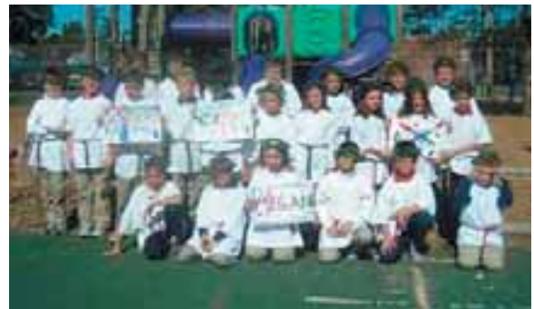
On Friday, October 13th, the 3rd graders participated in the second annual Greek Olympics and later enjoyed a feast of Greek foods.

The high school winter formal "SILVER BELLS" has been rescheduled for Wednesday, December 20th to avoid conflicts with students studying for finals.